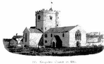
19. Kingsclere Church in 1846

Thank you for your great support for our Plant Sale at the end of May.